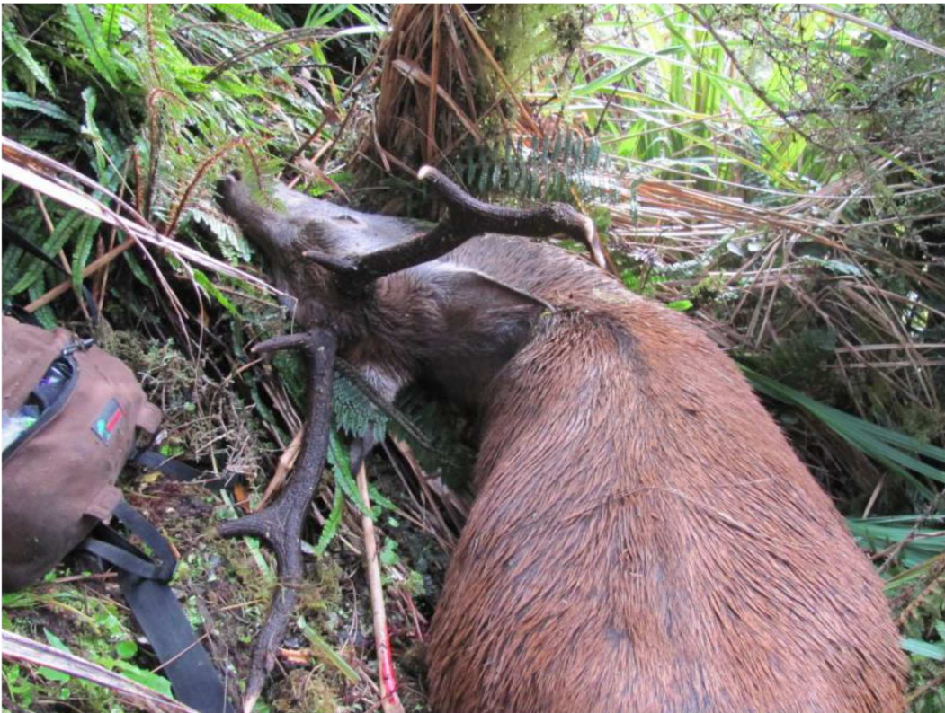
Red stag shot Ruahine Forest Park 2013 roar.