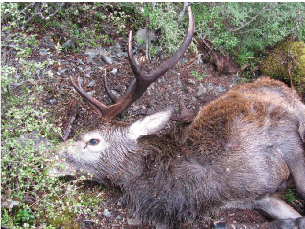
Red stag shot Ruahine Forest Park 2014 roar.